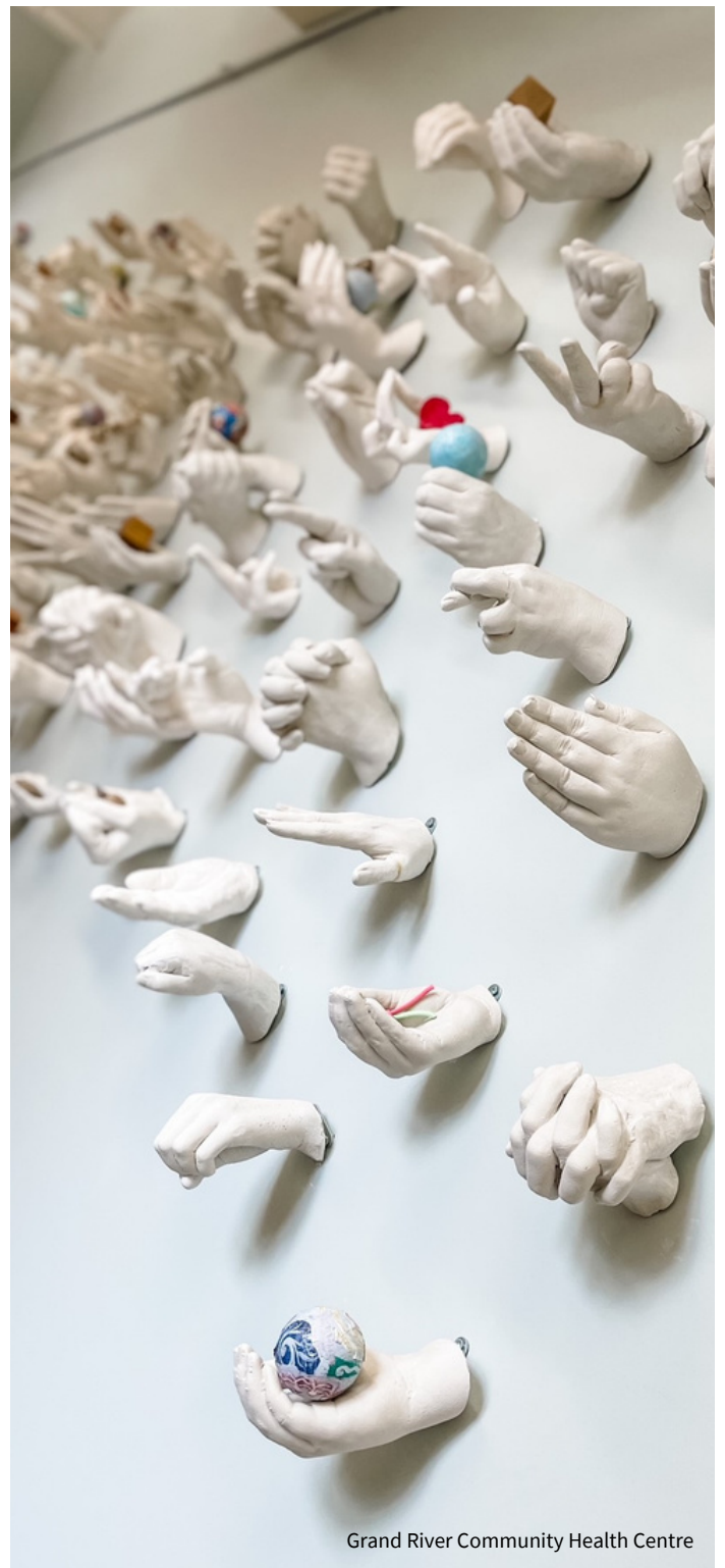
Grand River Community Health Centre